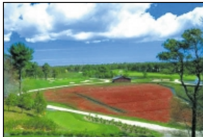
Just one of the beautiful Holes at Willowbend Country Club

the "Bay Course," each offering stunning views and challenging holes. As always there will be the traditional raffles along with a Silent Auction of Sports Memorabilia. In addition, the Air Cannon is re-